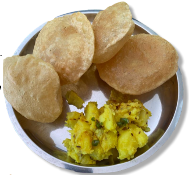
Recipe: Shikha Chaturvedi

Serve with puri or roti (fried or flat bread).