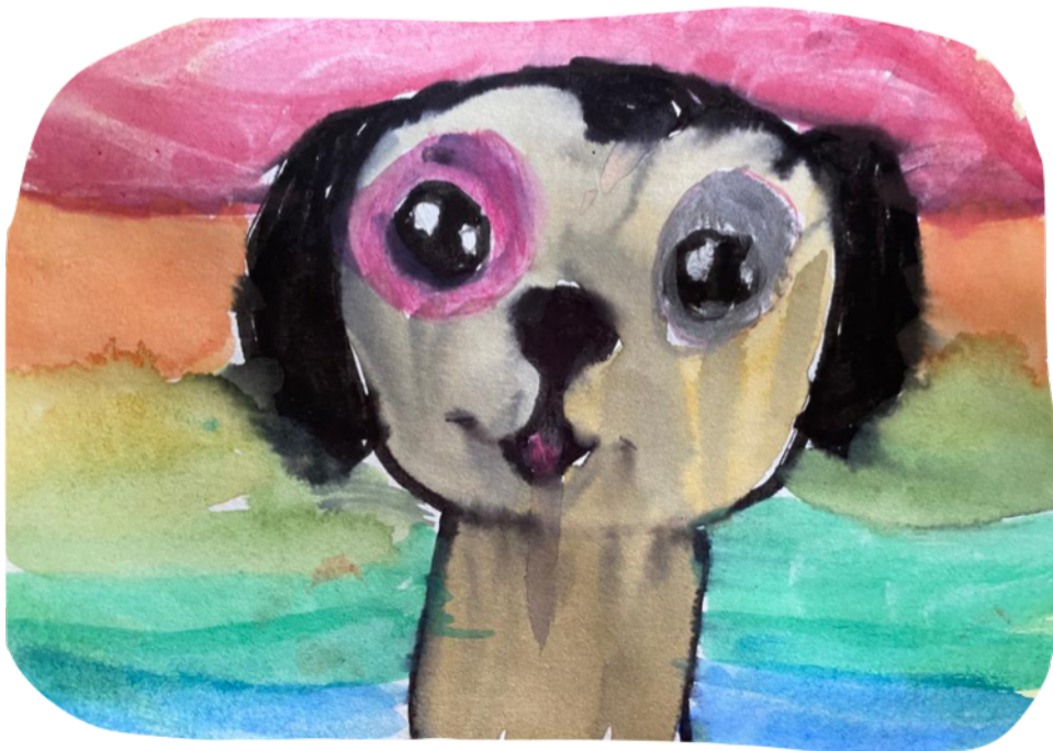
Artwork by Das Gauri

One day, a destructive thunderstorm hit the village. There was chaos in the