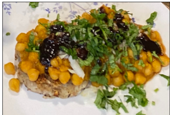
Recipe: Das Tejpal Singh

2.5 cups of chickpeas (soaked overnight, rinsed and cooked in a pressure cooker with salt until tender. Retain some of the water from the boiled chick peas) 2 tbs olive or coconut oil 6-8 cloves 4-6 cardamom pods – shelled 6-8 peppercorns 2 bay leaves 4 medium onions, (2 finely chopped and 2 to be ground in the paste) 2 cups of chopped ripe tomatoes; or one can of ripe tomatoes 2 tsps crushed fresh ginger 4 tsps crushed fresh garlic 2 tsps cumin seeds 4 tsps coriander powder 1 tsp turmeric powder 3 tsps garam masala Chillies to taste Salt to taste