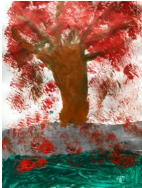
Created by Das Gauri