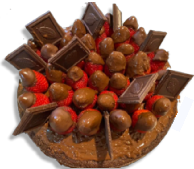
Recipe and photograph: Das Neelkamal

For the glaze: Melt chocolate in a heatproof bowl set over simmering water, stirring until smooth. Let cool slightly and pour over the cake. Decorate with berries of your choice.